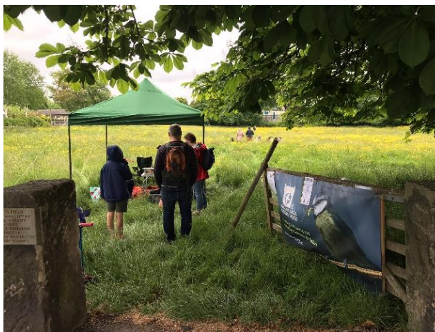
Figure 4 Miss Porritt's field event

MANT's first full year as a charity has been a resounding success. The Wild Gardens Open Day in May 2022 attracted over 80 people and highlighted six very different, but very nature friendly, gardens. Miss Porritt's field has benefitted from conservation grazing by three Dexter cows, and with the help of Years 2 and 3 of Menston Primary School, over 280 native trees were planted. Scouts groups spent sessions surveying plants and bugs, a Jubilee Oak was planted and an open day encouraged local residents to explore the field.