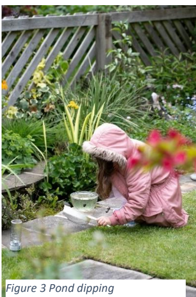
Figure 3 Pond dipping

To promote the conservation, maintenance and study of places and objects of botanical, zoological, geological, ecological or scientific interest in and around Menston and elsewhere by:-