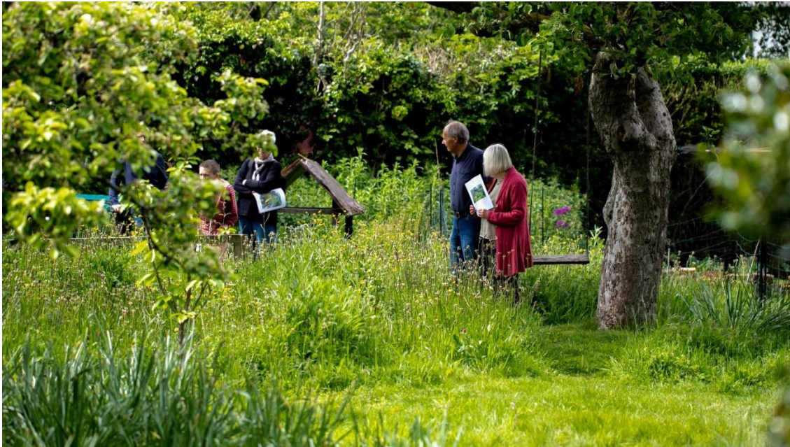
Figure 2 Wild Gardens Open Day May 2022